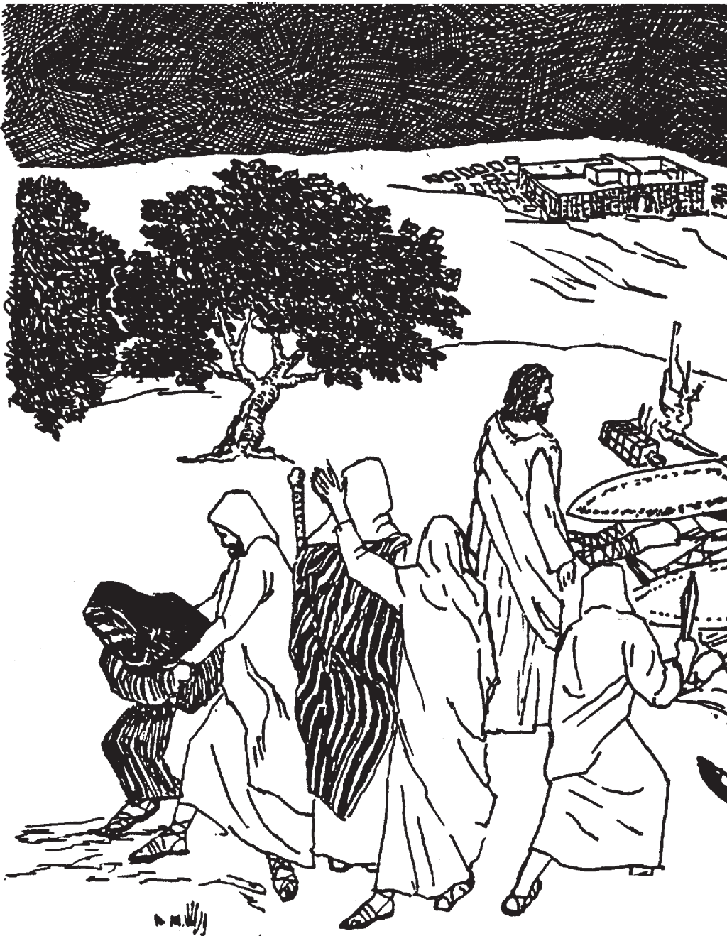
Figure 4 ARREST OF JESUS

AB John 18:4-9 Then Jesus, knowing all that was about to befall Him, went out to them and said, Whom are you seeking---Whom do you want? They answered Him, Jesus the Nazarene. Jesus said to them, I am He. Judas, who was betraying Him, was also standing with them.